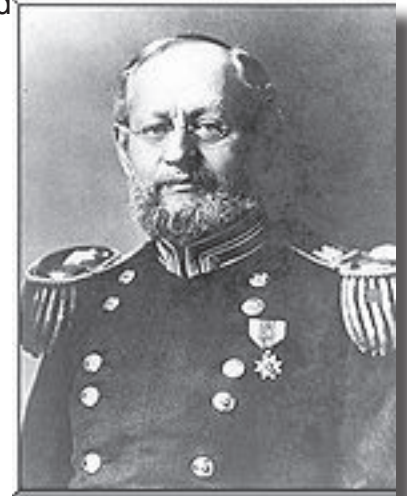
Bob, also known as Henry Martyn Robert, the author of Robert's Rules of Order.

My friends at Five Seasons Parliamentarians want to help other people get to know Bob. If we make parliamentary procedure fun and exciting, then more people will be intrigued and will use Bob.